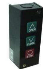
Push Button Station