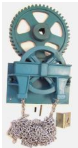
Pull Chain System